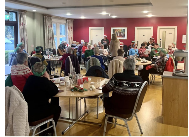
"This is Me" Choir entertaining guests at Christmas

One part of the Drumalis Vision Statement refers to "A living community where all experience the power of God's love and compassion." In 2025, we hope to build on this "living community" by offering more in-house retreats, events, lunches and days of reflection as well as strengthening links with local community groups such as Extern and with schools and churches. There is much to look forward to in the year ahead.