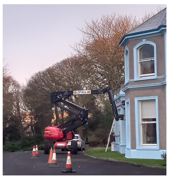
Work begins on re-painting the Heritage House

Over the past two months we have been getting necessary renovations done to the exterior of the house, with guttering replaced, windows repaired and a start has been made to painting the Heritage House. The plunge in temperature may mean that we have to wait until spring for the painting to be completed, but it will be well worth the wait.